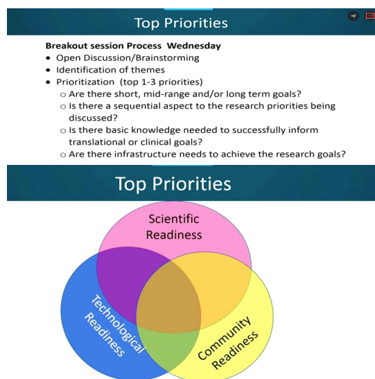
Figure 1 Lyn Jakeman’s slides about the goals of the SCI 2020 meeting. Identify goals and priorities based on both scientific and technological readiness as well as importance to the SCI community 1:55 in the Day 1 video.

Lemmon VP (2019) What does “Disruptive” mean? Thoughts on the NIH SCI 2020 meeting. Neural Regen Res 14(9):1527-1529. doi:10.4103/1673-5374.255969